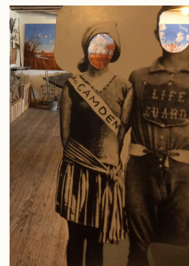
Play on the Bayshore,